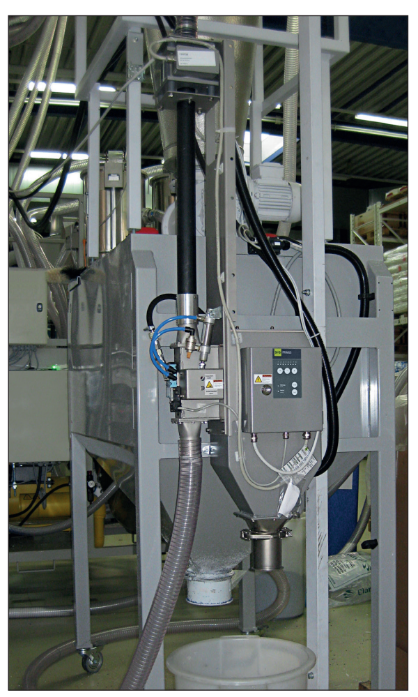
Installation example: Metal separator GF installed in a vertical pipeline (old version)

It detects all magnetic and non-magnetic metal contaminants (steel, stainless steel, aluminium, etc.) — even when they are enclosed in the product. Metal contaminants are ejected via the "Quick-Flap" separation unit.